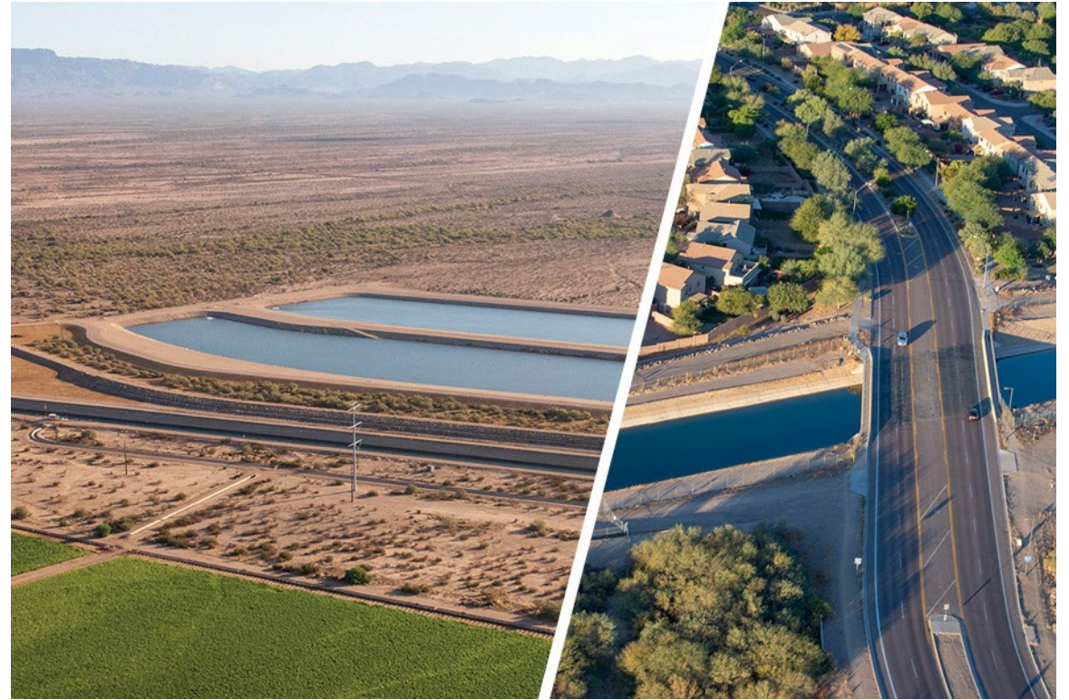
Superstition Mountains Recharge