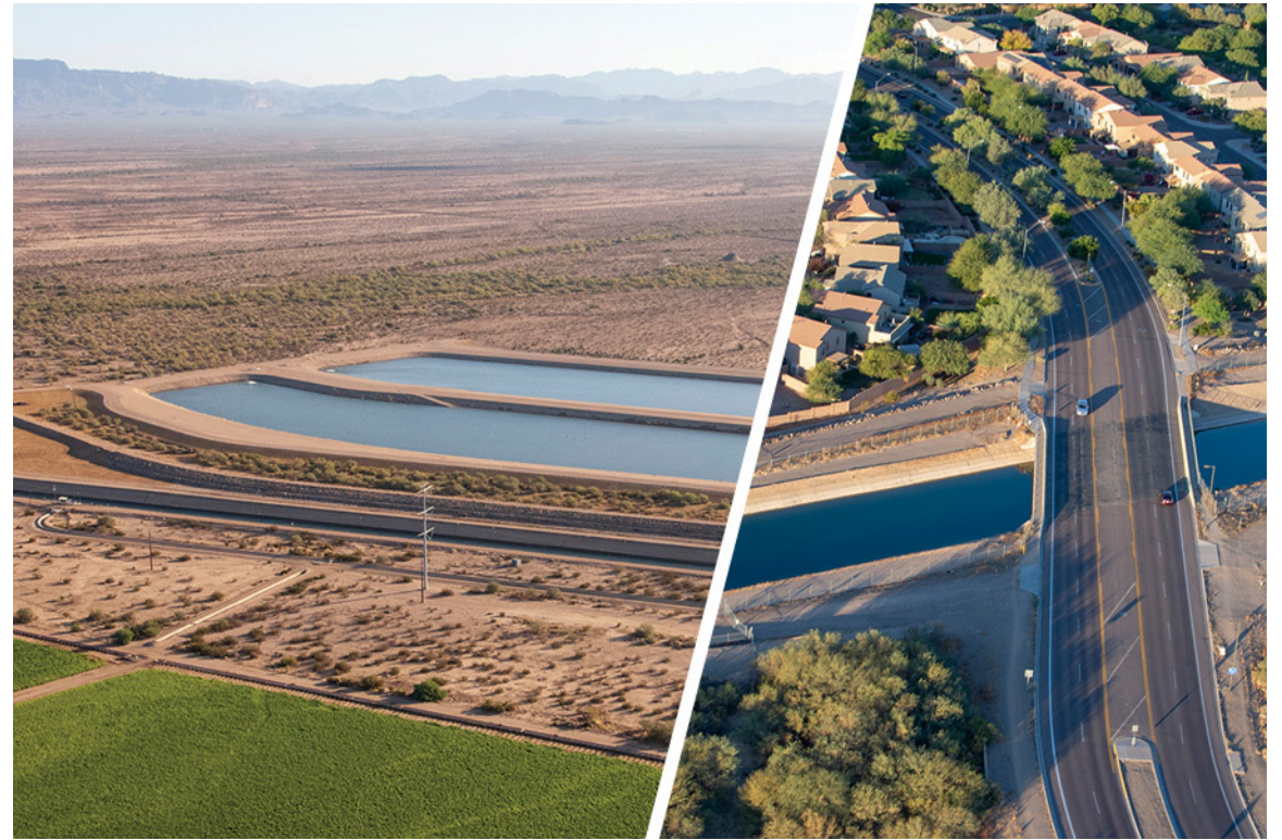
Superstition Mountains Recharge