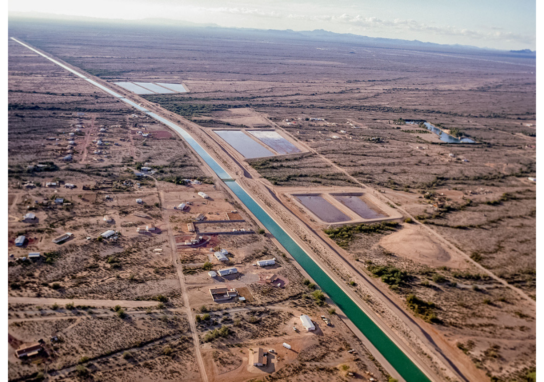
Hieroglyphic Mountains Recharge