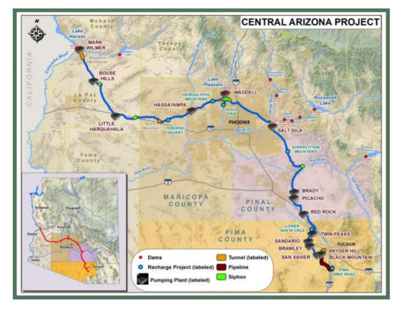
"The CAP System"

The Colorado River drives the economy of Central Arizona. The Central Arizona Project (CAP) delivers Colorado River Water from Lake Havasu to the central and southern portions of the state, actualizing the Five C's of Arizona. The water allows for intensive agricultural systems and large-scale mining operations. Three of the five C's are directly related to agriculture: cotton, citrus, and cattle (Dewalt 2014). Central Arizona's agricultural water will be the first sector to lose its share when a river shortage occurs. This water is the lowest priority of the Central Arizona Project's allocations. The Central Arizona Project has the junior priority of the Colorado River water allocations for Arizona, which means it will be the first to be surrendered in times of river water shortage (USBR 2019). With the predicted hotter, drier climate, the states within the Colorado River Basin had to design a plan to mitigate a shortage declaration. This paper evaluates the policy changes of the Lower Basin Drought Contingency Plan (LBDCP) and its impact on Central Arizona Agriculture.