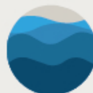
ON-RIVER WATER USERS